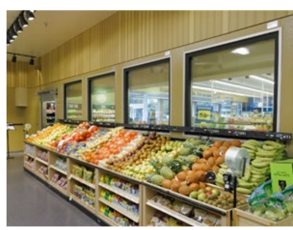
Optional & elegant interior trim frame kit