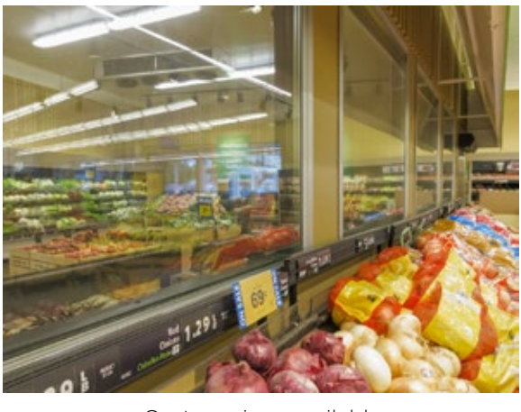
Custom sizes available